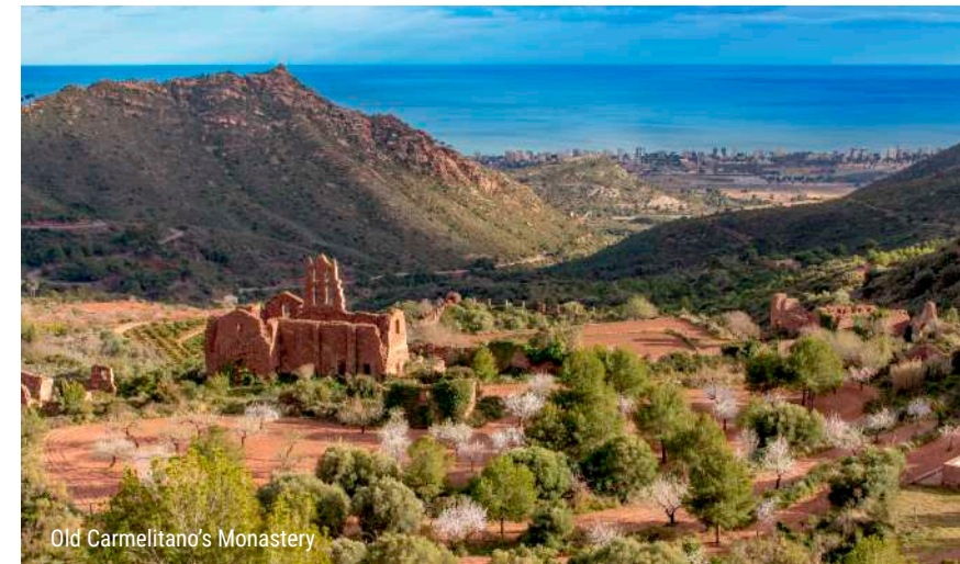
Old Carmelitano's Monastery

The sober and elegant structure of the monastery was determined by the Order of the Carmelite Monks and St. Teresa of Jesus; the different rooms are arranged around the church, found at the physical centre and heart of the architectural ensemble. Positioned around the temple are the rooms and common areas,