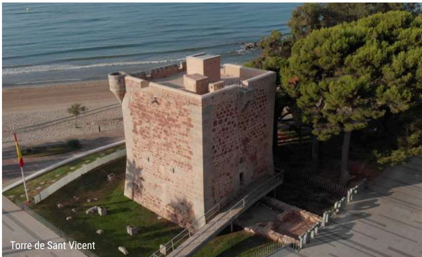
Torre de Sant Vicent

The Torre de Sant Vicent Interpretation Centre currently has an interactive exhibition space dedicated to explaining the historical context in which the Sant Vincent and Sant Julià watchtowers were built, showing various aspects related to piracy and the Kingdom of Valencia coastal defense system between the 16th and 19th centuries.