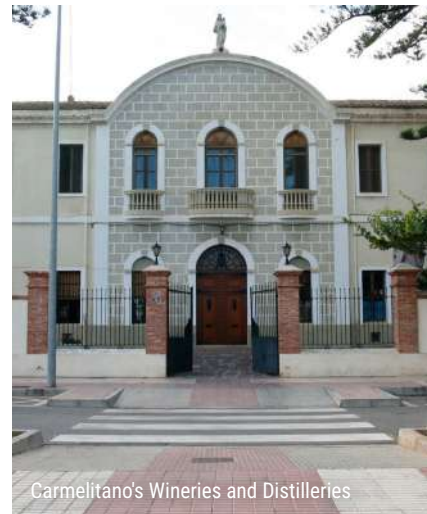
Carmelitano's Wineries and Distilleries