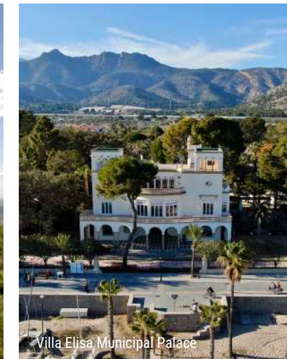
Villa Elisa, Municipal Palace