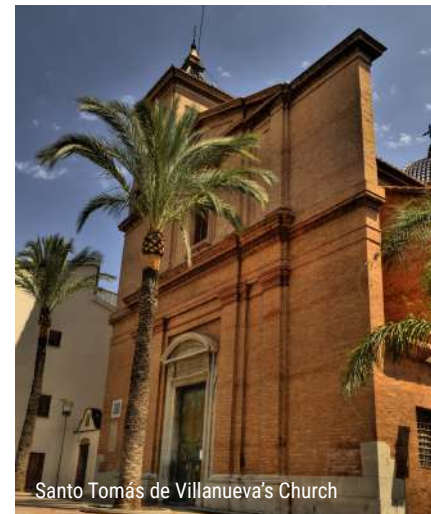
Santo Tomás de Villanueva's Church

Inside, besides its purely formal ornamentation, we find paintings by Camarón, a painter born in Segorbe. Its layout is rectangular with just one nave in the form of a Latin cross, but without any side chapels. The nave is divided into three sections, with transept, presbytery and alter end. At the foot of the church in the first section is the high choir, which shares access with the bell tower. Outside stands out its rectangular facade.