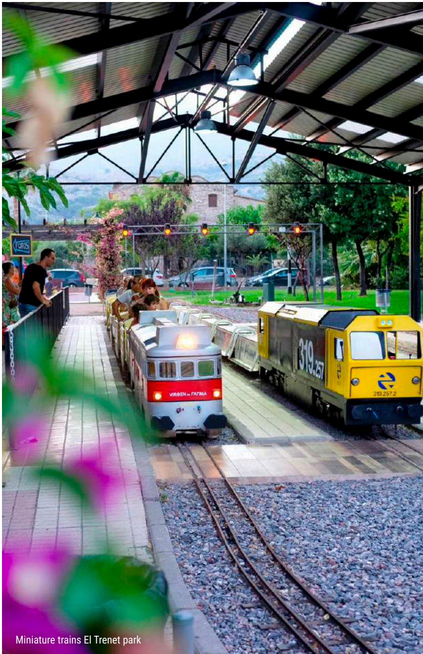
Miniature trains El Trenet park

During the summer, El Trenet park has a unique agenda that you can not miss.