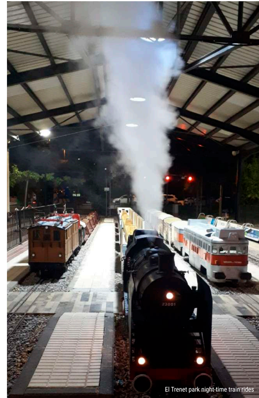
El Trenet park night-time train rides

Enjoy special rides during the summer nights under the moonlight.