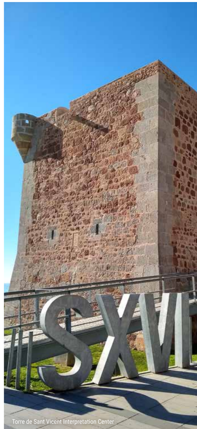
Torre de Sant Vicent Interpretation Center