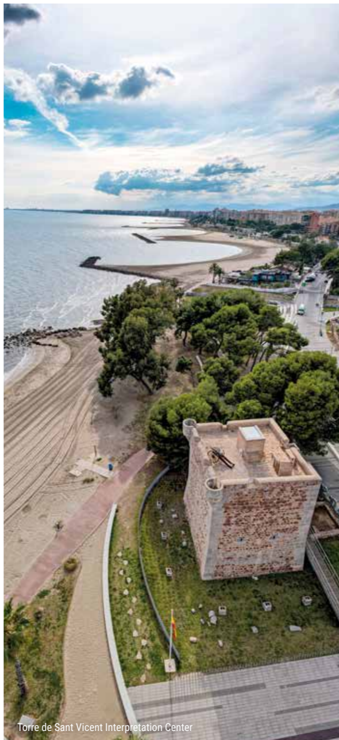
Torre de Sant Vicent Interpretation Center