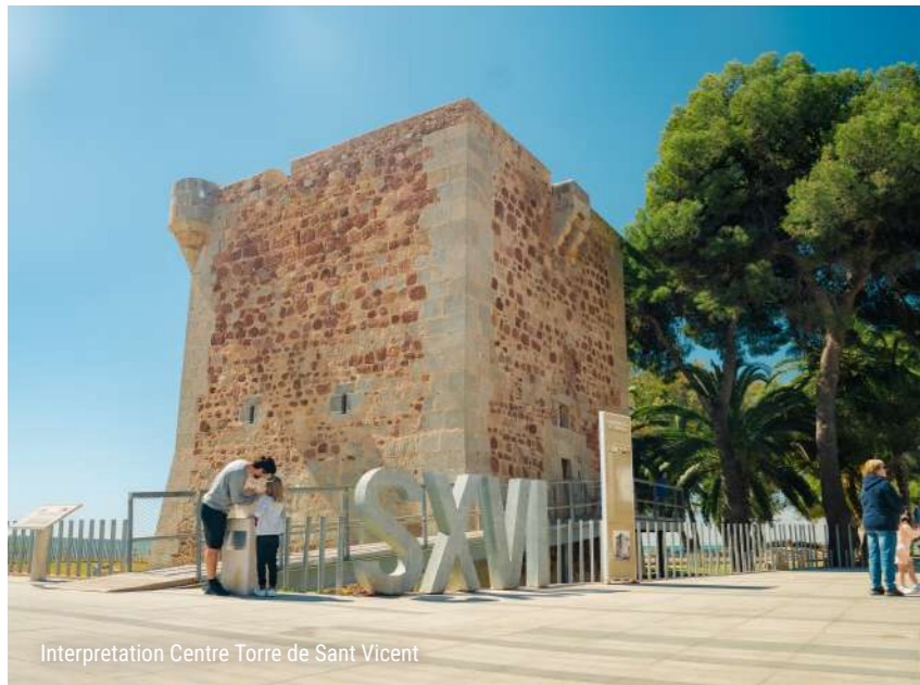
Interpretation Centre Torre de Sant Vicent

The religious heritage also offers interesting options, such as the church of Santo Tomás de Villanueva and the Desert de les Palmes monastery . The latter, located in the heart of nature, allows for combining culture and hiking in an ideal experience for families. The little ones can explore ruins full of history while learning about monastic life and the natural environment around it, in a plan that unites education, fun and the outdoors.