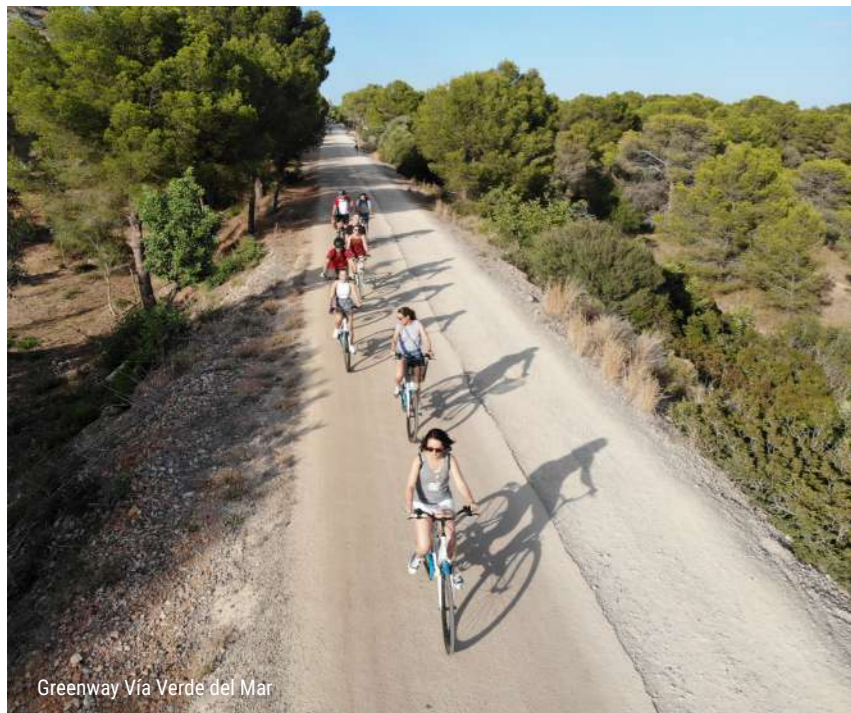
Greenway Vía Verde del Mar

For the more adventurous, the Desert de les Palmes offers a network of hiking trails perfect for families, with itineraries of different difficulty levels. The paths are well-marked and pass through landscapes of great ecological value, with Mediterranean vegetation and rest areas ideal for a stop with children. It is a safe and educational option for enjoying the outdoors as a family. In this area, you will find the Bartola Interpretation Center, which offers information and explanatory panels on the history, fauna, and flora of this natural enclave.