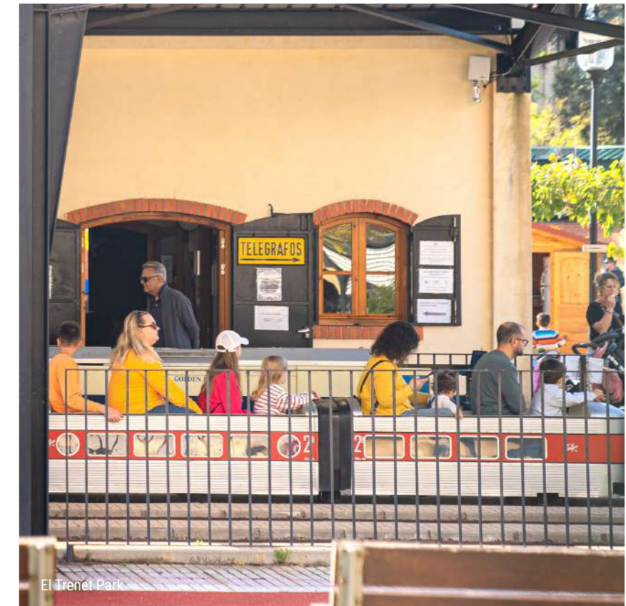
El Trenet Park

In addition, go-karts and bowling are perfect options for enjoying moments full of excitement and laughter, suitable for all ages and levels. With these and many others alternatives, Benicàssim guarantees entertaining and varied plans so that the whole family can have fun and create unforgettable memories during their stay.