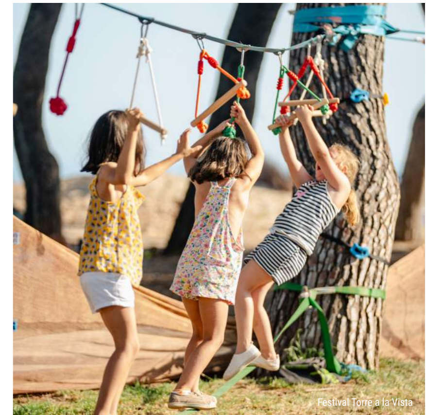
Festival Torre a la Vista

In Benicàssim, every day is a new opportunity to create unforgettable family memories. Whether practicing water sports, discovering local history, or simply relaxing by the sea, the destination combines tranquillity, fun, and quality services to make your family holiday perfect.