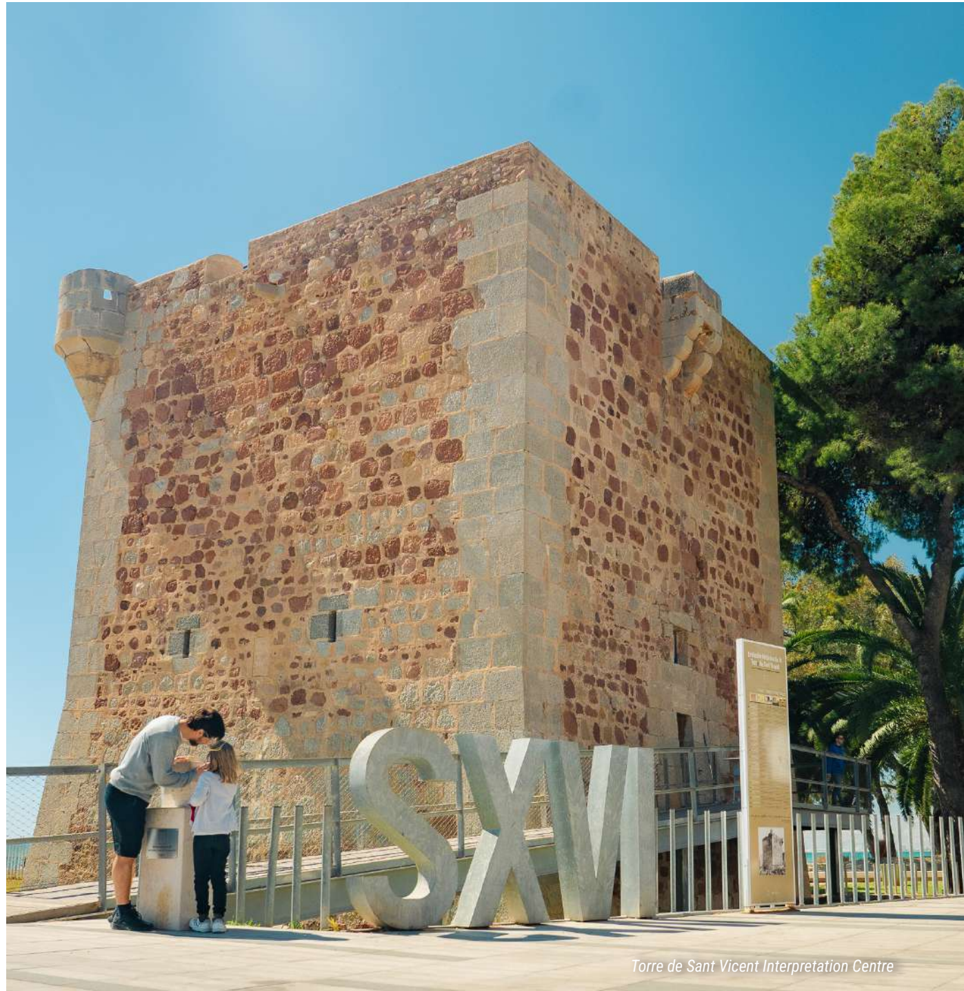
Torre de Sant Vicent Interpretation Centre

Torre de Sant Vicent: a witness of the past