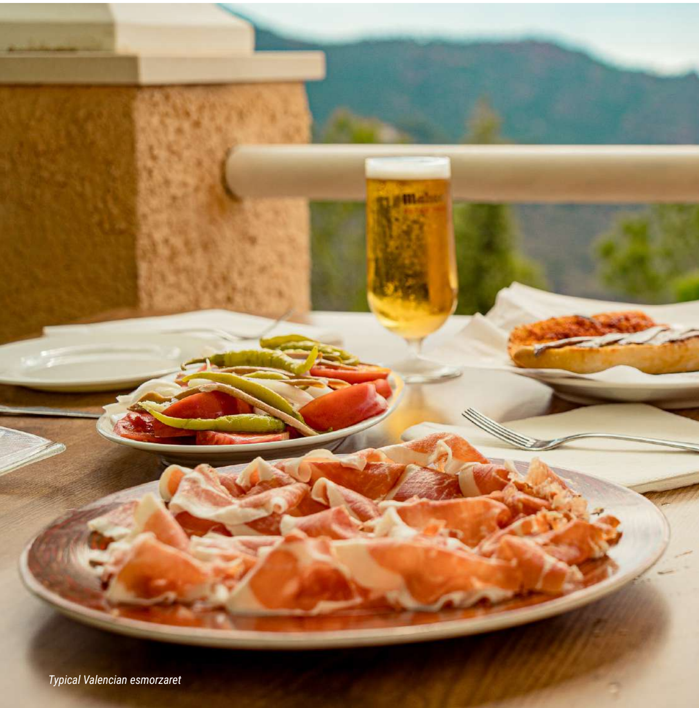
Typical Valencian esmorzaret