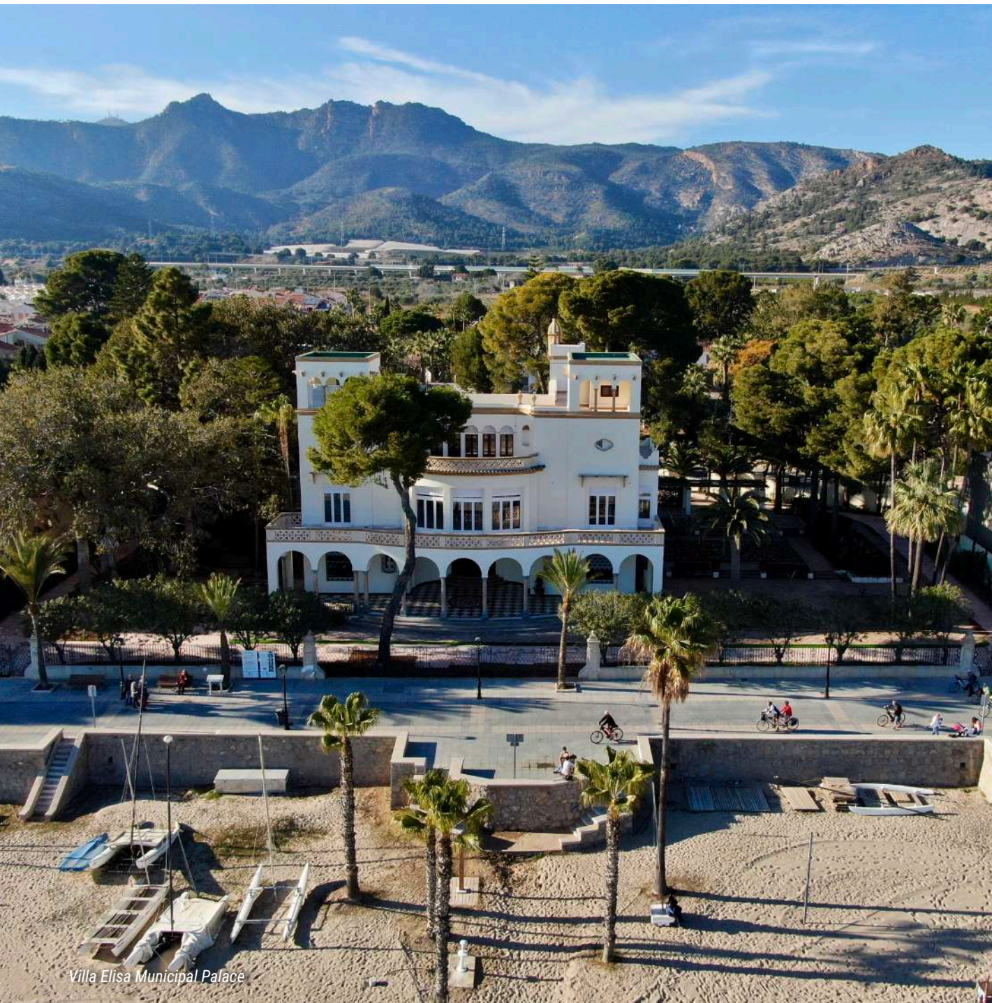
Villa Elisa Municipal Palace