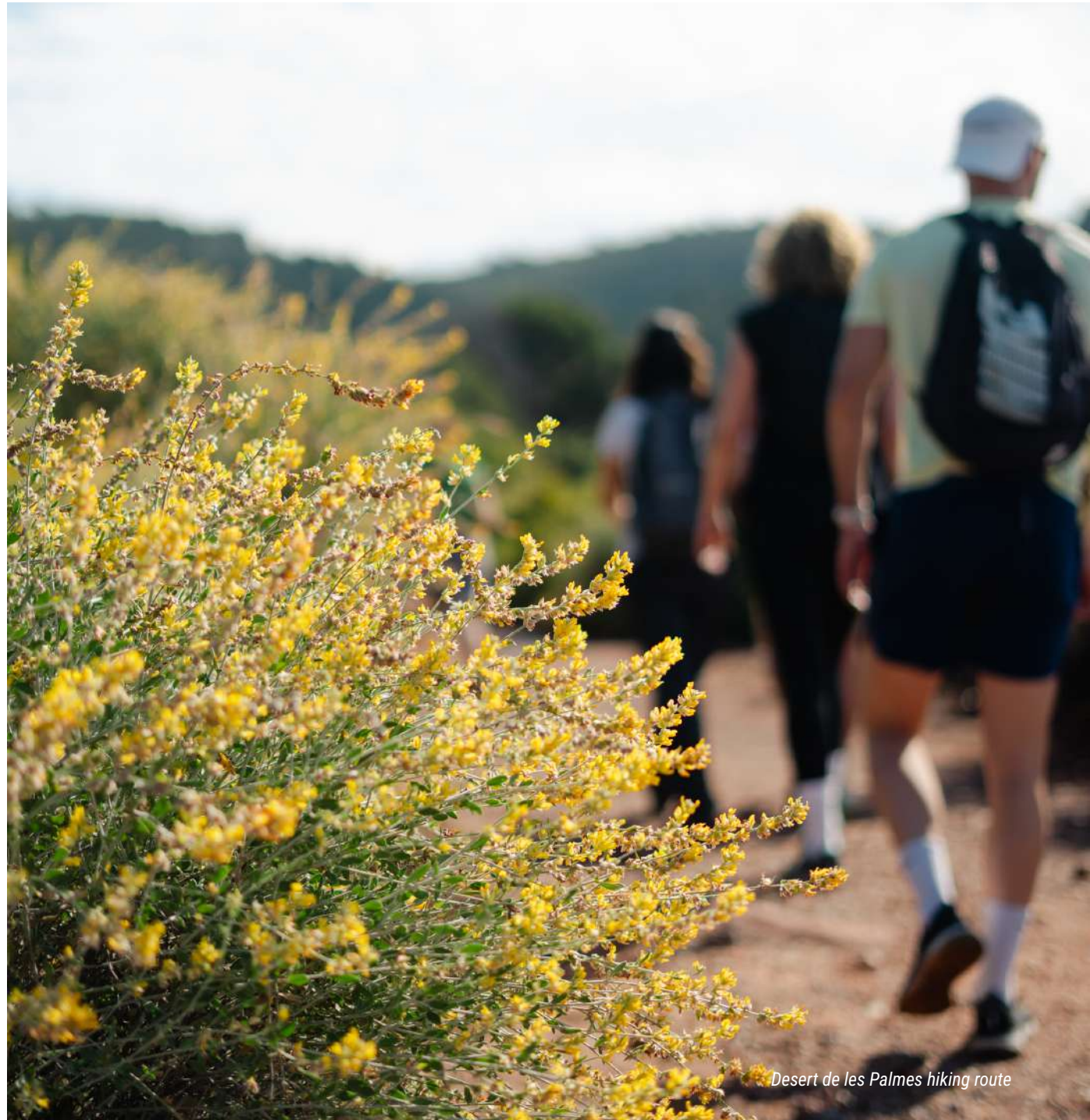
Desert de les Palmes hiking route