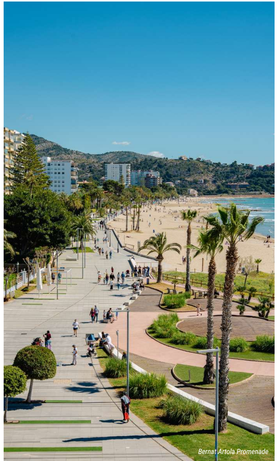
Bernat Artola Promenade