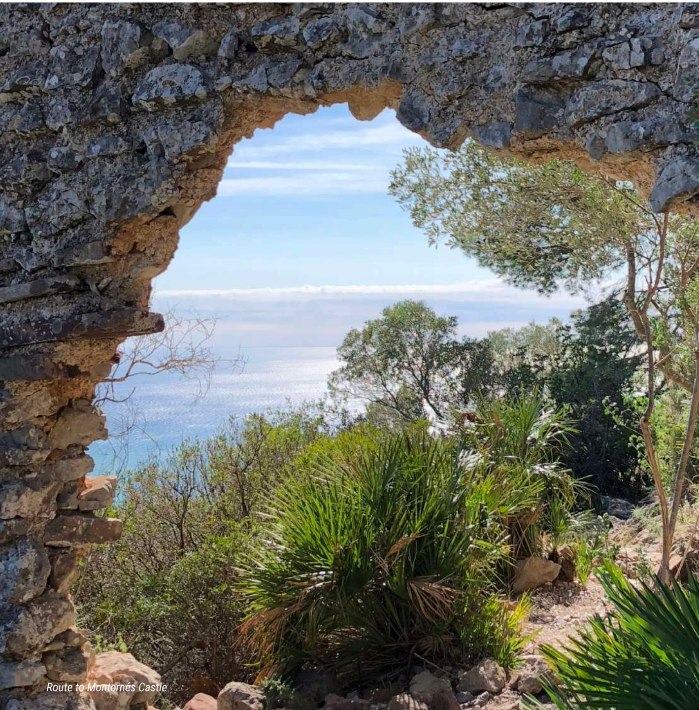
Route to Montornés Castle