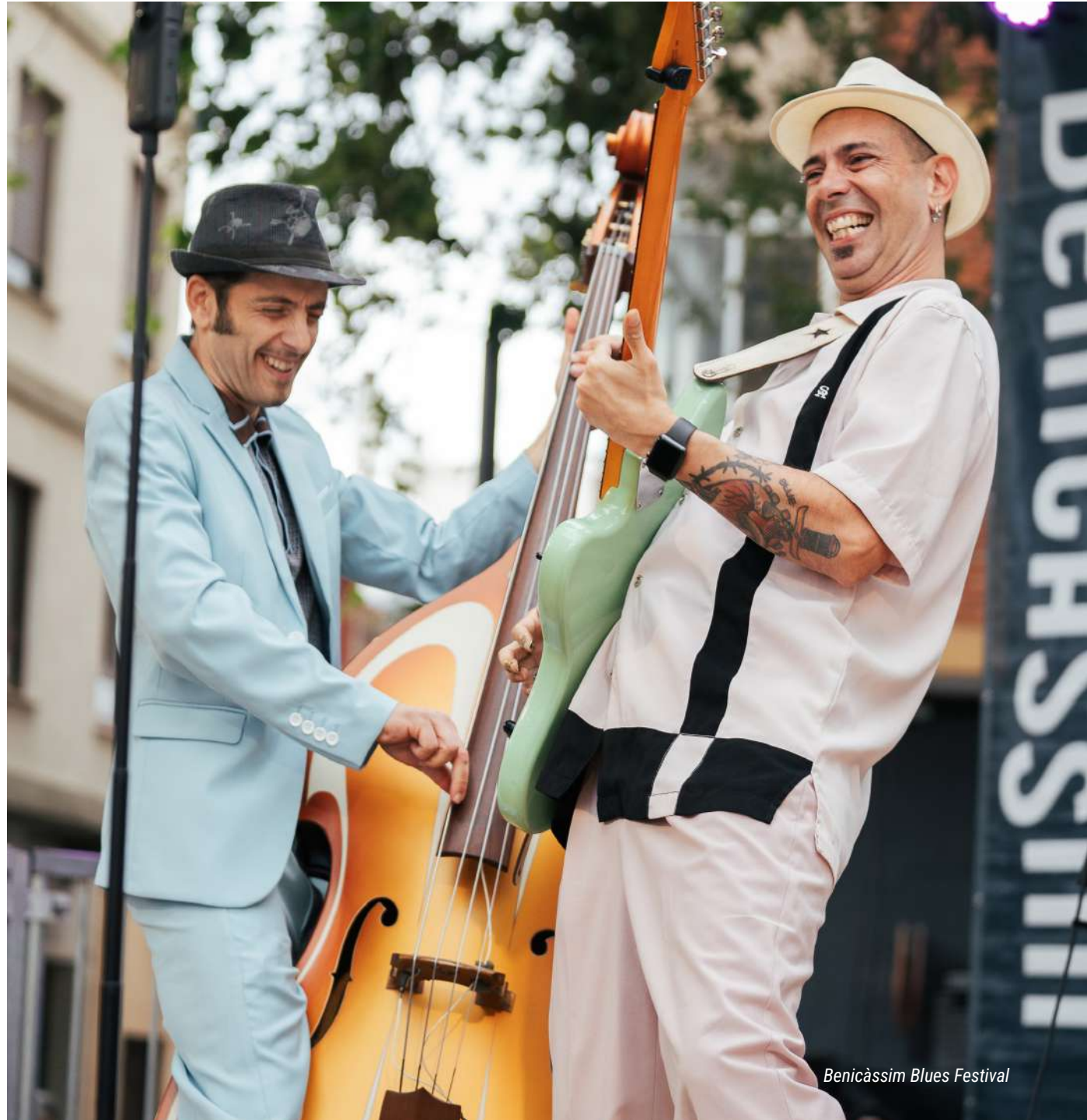
Benicàssim Blues Festival