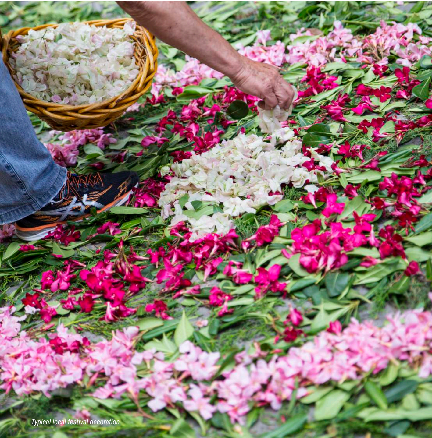
Typical local festival decoration