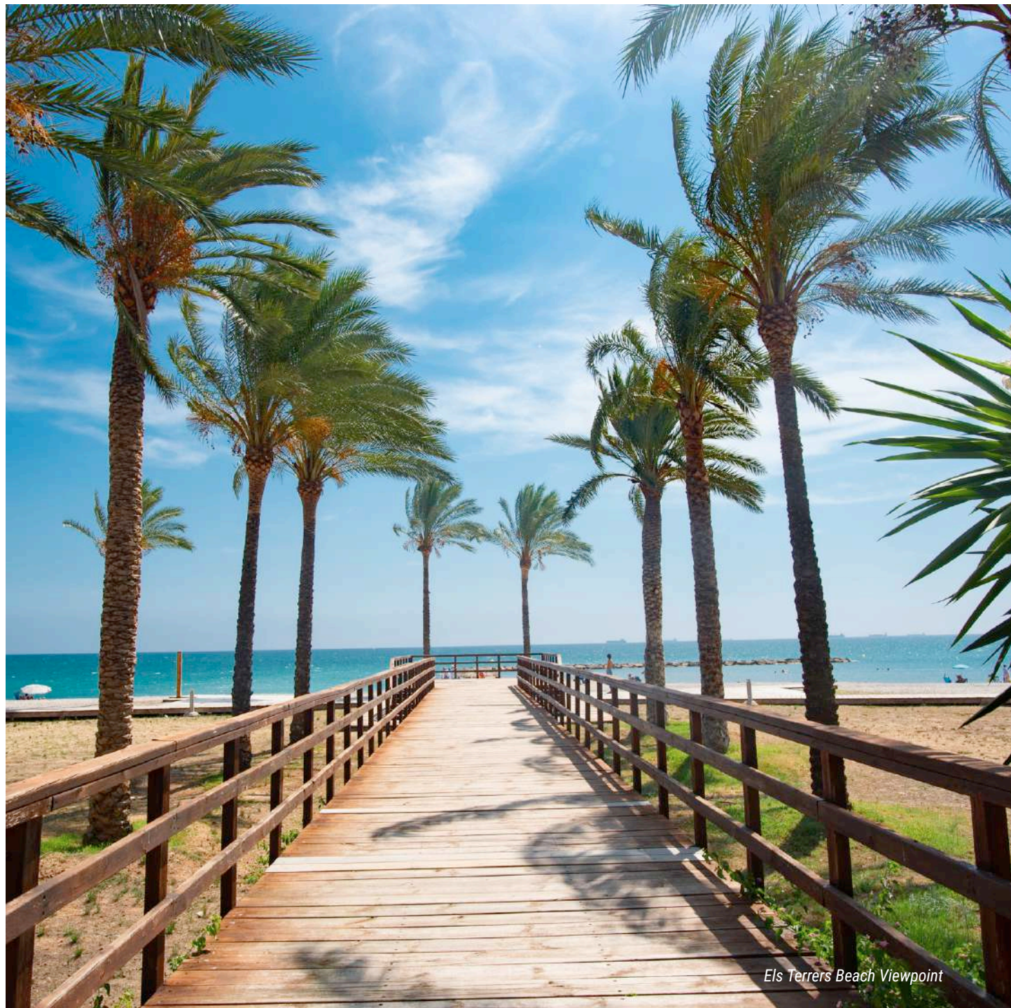
Els Terrers Beach Viewpoint