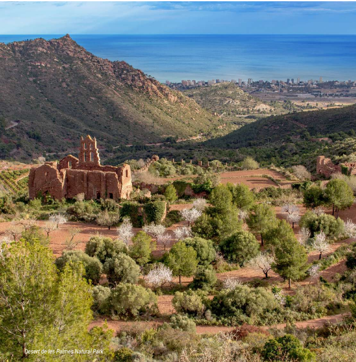
Desert de les Palmes Natural Park