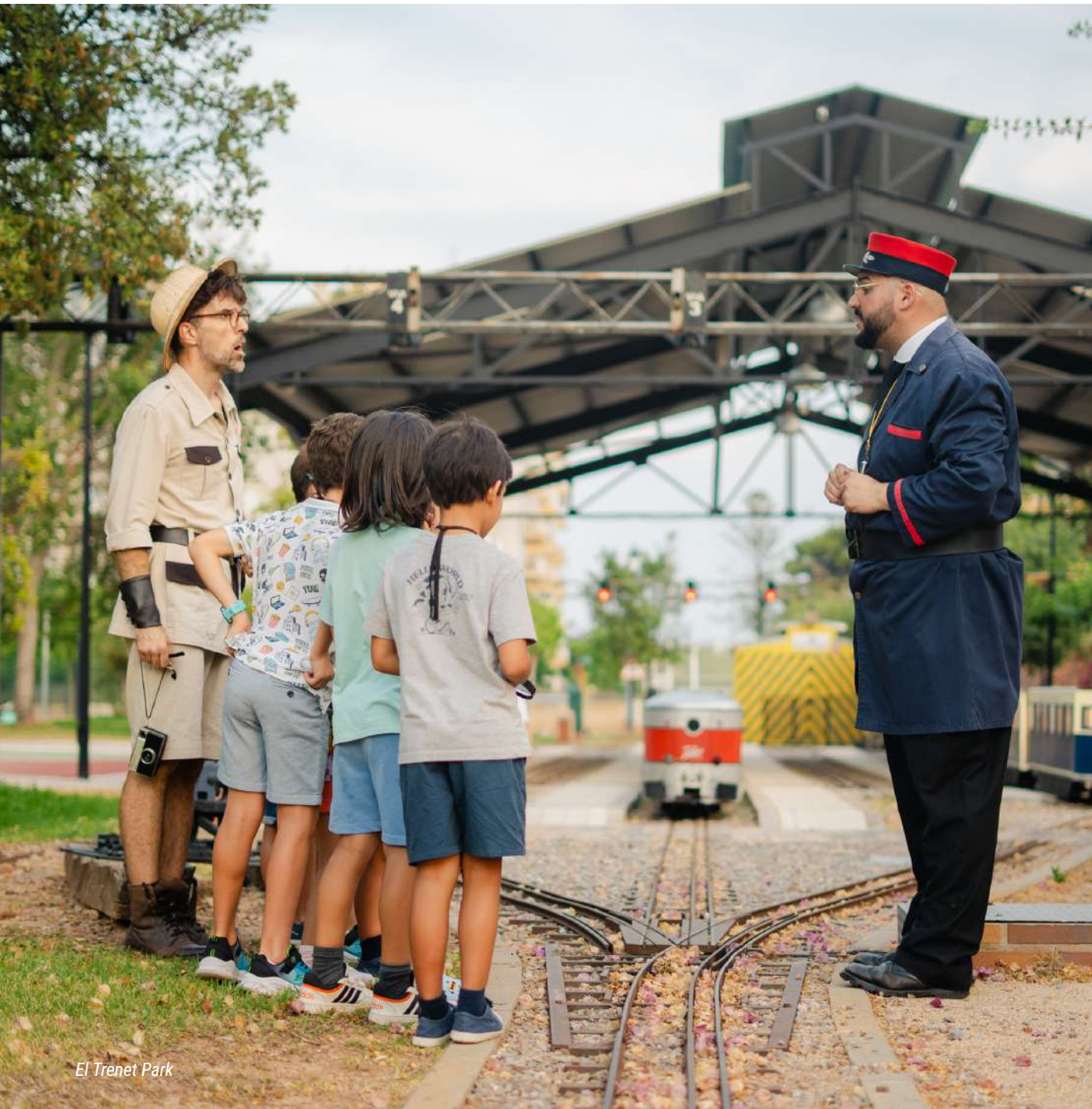
El Trenet Park